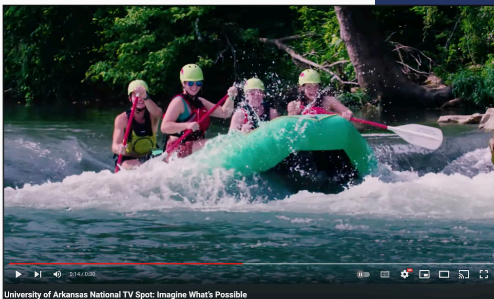
University of Arkansas National TV Spot: Imagine What's Possible

Follow us on Instagram @outdoorleadership_ark