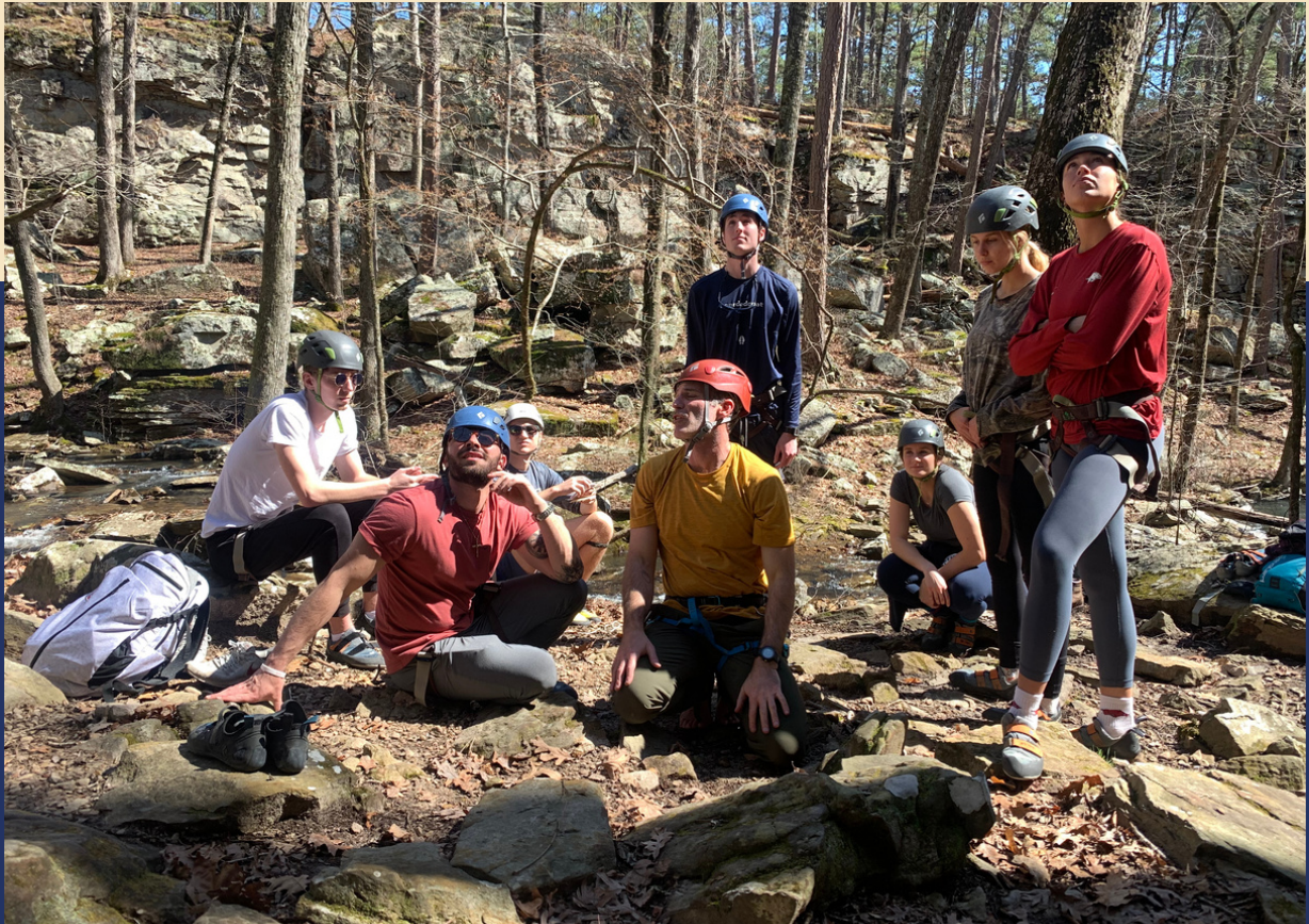
STUDENTS IN NATURAL RESOURCES AND OUTDOOR ETHICS EVALUATE A ROCK CLIMBING ROUTE DURING A FIELD-BASED COURSE EXPERIENCE.